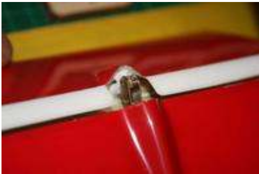
Control rod installed