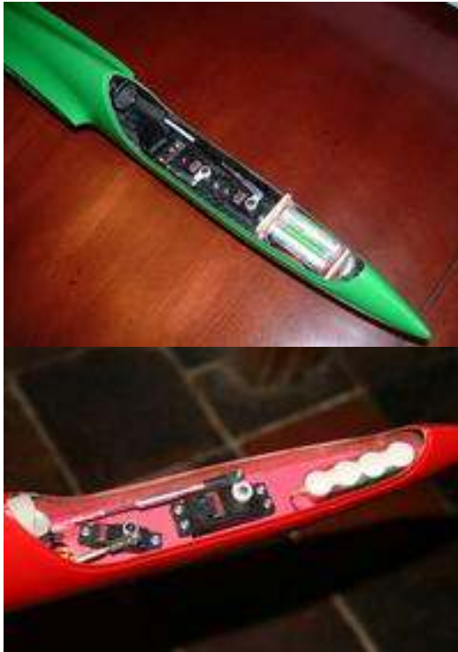
Examples of other battery/servo setups