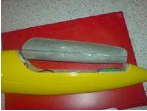
Canopy with wire fitted but not installed.