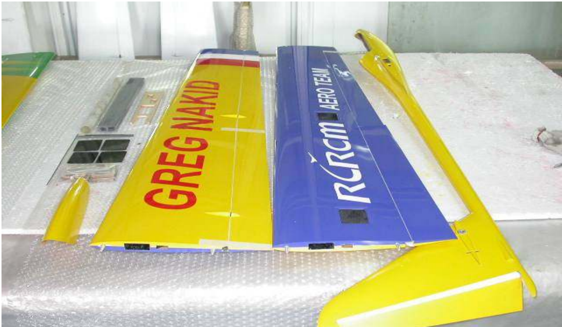
The vector III parts.