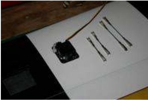
Control horns for ailerons and flaps